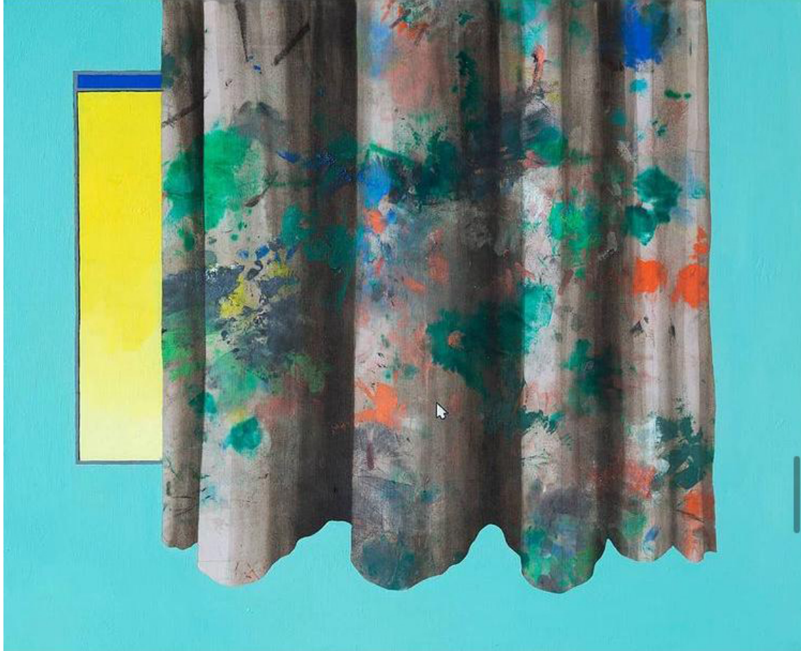
Fenêtre et rideau 2 , 2019 Oil on rag mounted on canvas 21.26 x 24.8 in Unique artwork Signé INV Nbr. GY20200110