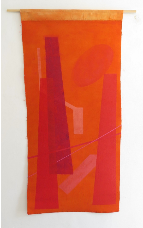
Contacto V , 2022 Acrylic on canvas 66.14 x 30.71 in Unique artwork Certificat d'authenticité INV Nbr. GY202020181